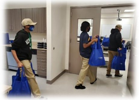
JROTC students prepare to deliver meals